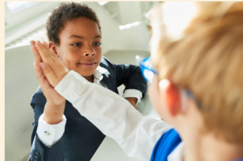
SAYING "GOOD JOB" OR "HIGH-FIVE" TO THE WINNER