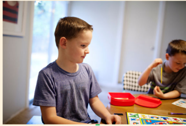
WAITING FOR YOUR NEXT TURN