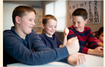
ALWAYS WANTING TO BE THE FIRST TO GO