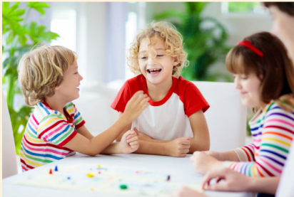
SOMETIMES LETTING OTHERS GO FIRST