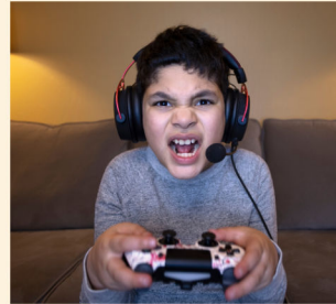
SAYING BAD WORDS