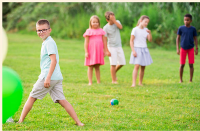
INVITING OTHERS TO PLAY