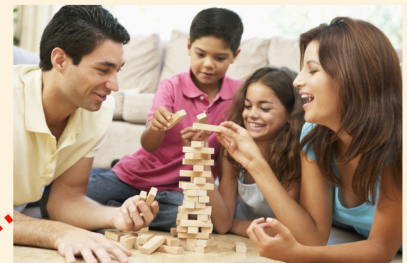
NOT TAKING TURNS