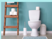
Using the bathroom